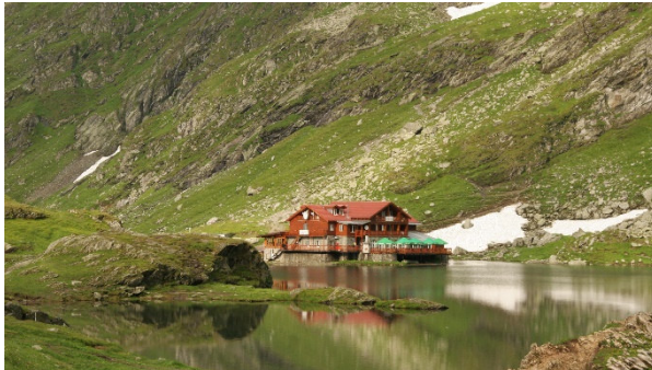
Balea Lac mountain hotel